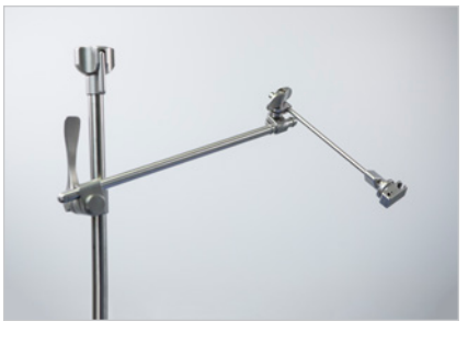
Rigid Holder for Elite or IHRC

Articulating Arm for Elite or IHRC Holds firmly with a wide range of motion.