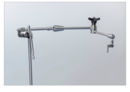
Articulating Arm for PRC Holds firmly with a wide range of motion.

Unlimited range of motion and positioning with adjustable tension from flexible to rigid.