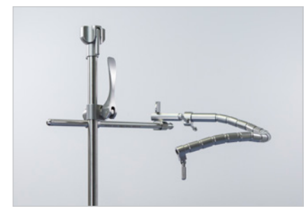
Flexible Holder for Elite or IHRC

Tip: Use two laparoscopic holding arms with one rail clamp by selecting the Elite III or Infinite Height Rail Clamp with 2 Cam Joints. (shown above with Elite III)