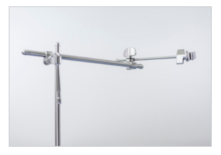
Rigid Holder for PRC

Precise, rigid positioning for instruments requiring few adjustments or holding excess weight.